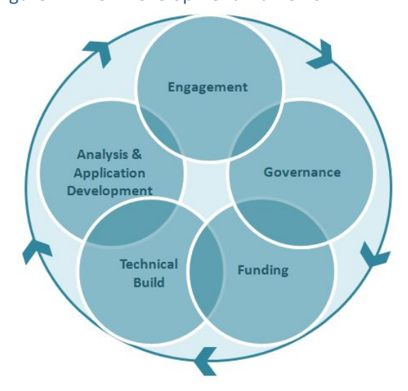
Figure 1. APCD Development Framework

As health care delivery and payment reforms are implemented, and as health care continues to transition to a more analytic-driven industry, states are finding that payer data are a necessary asset. To support states seeking to build this asset, the APCD Council Team has developed a manual<sup>3</sup> for states to follow when planning and implementing APCDs. The APCD Development Manual contains a framework, encompassing the collective lessons learned across all APCD states and describes an evidence-based set of tools and practices to guide stakeholders through the planning and development processes. The APCD development framework is illustrated in Figure 1.