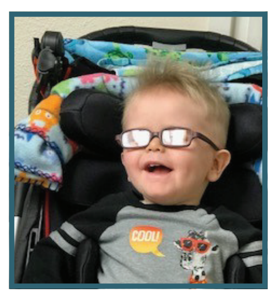
My little visitor