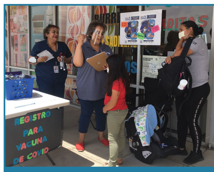
CHWs provide COVID vaccine information and registration outside a restaurant nearby El Paso county line.

OHE : Sweet triumph! You talked about ensuring fair pay to help advance health equity in our communities. Can you tell us more?