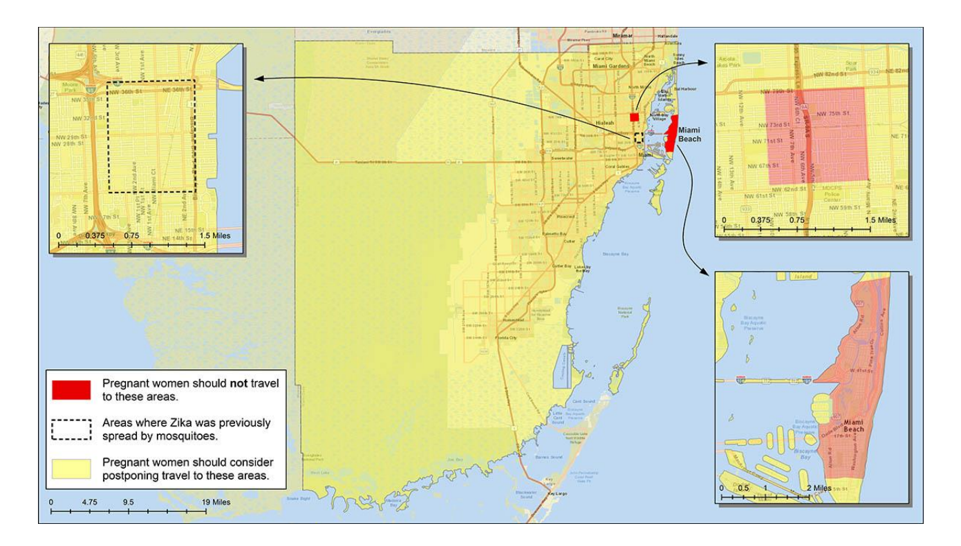
Figure 2. Miami-Dade County, Florida

Red shows areas where pregnant women should not travel. Yellow shows areas where pregnant women should consider postponing travel.